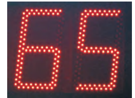
Digits with 250 mm figure height