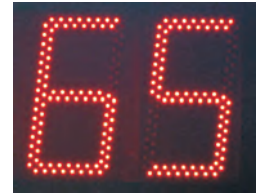
Digits with 250 mm figure height