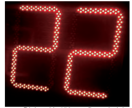
Digits with 450 mm figure height