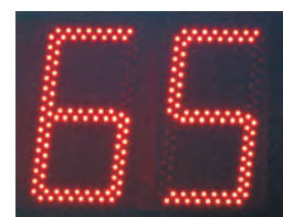
Digit with 250 mm figure height